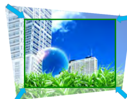
Curved Correction (EK-307W only)