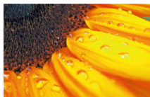
ColorSpark HLD LED